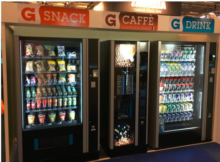
Trio DESIGN LINE (G-Snack, G-Caffè FS and G-Drink)