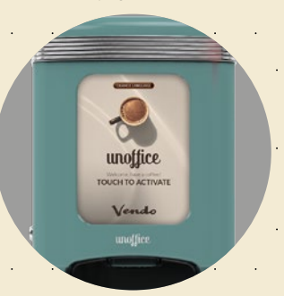
2. DRINK SELECTION